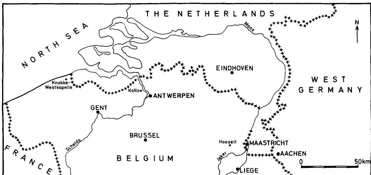
Fig. 1. Map of mentioned localities.

The Van Veen collection only comprises one slide, number 0.1418, labelled as " Krausella minuta Triebel Jekerdal Mc 3° Br. 1. v. St.", and contains one carapace and one right valve. The indications leave no doubt about the stratigraphical origin: the third Bryozoa layer of Staring, within the "Mc"